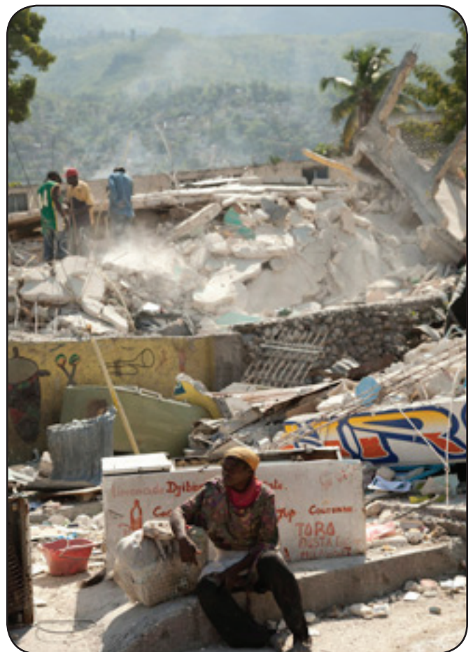
Severe damage in a residential area of Port-au-Prince, Haiti after a major earthquake occurred on January 12, 2010. Over 150,000 people were killed and schools, hospitals homes and the presidential palace were destroyed.