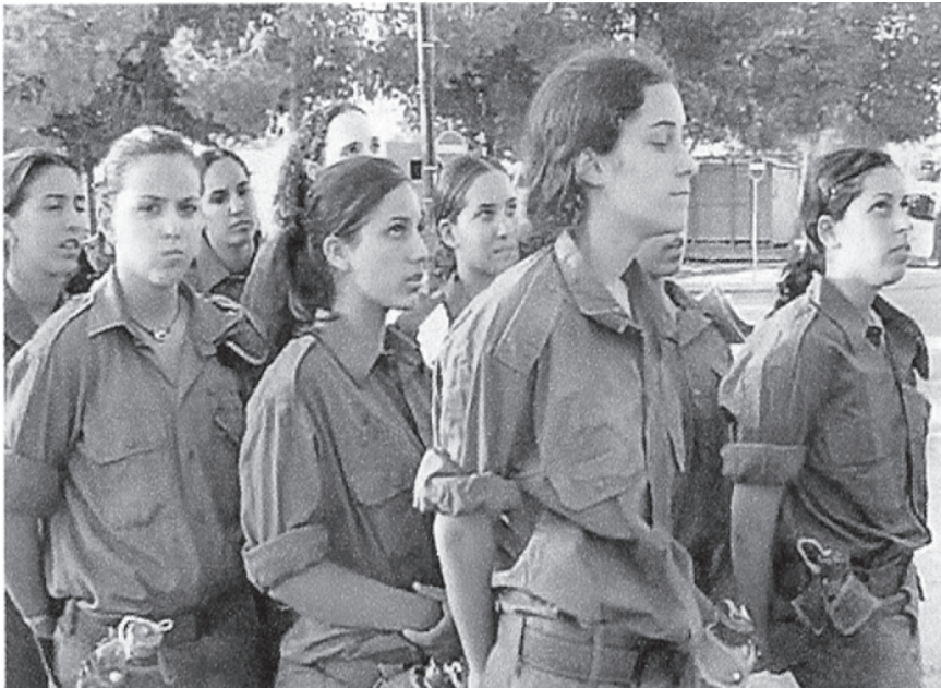
11th grade pupils in the Carmel-Zvulun Regional School in the north of Israel on parade in the Youth Battalions Training Week.